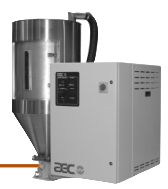
ADM Machine Mount Dryer

The AD Series dryers are quality engineered to provide optimum drying performance under the most demanding conditions. The dual-bed, closed-process loop design incorporates many innovative features that consistently provide -40°F dewpoint in high humidity environments all the way up to 150 grains moisture level. All models include off-the-shelf microprocessor control for process temperature and desiccant regeneration. With high performance features in a simple, compact design, our AD Series dryers combine superior performance with easy operation and serviceability at an affordable price.