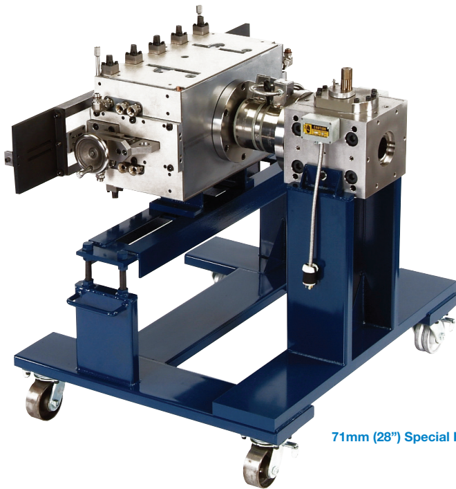
71mm (28") Special Heavy Duty PS Foam Board Die, Purge Block, and Die Cart

Nordson, a leading international supplier of extrusion die technology, provides a die system for extruded polystyrene (XPS) foam board that dramatically reduces downtime for product changeovers, enabling manufacturers to offset much of the loss in productivity caused by switching to a non-ozone depleting blowing agent.